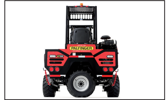
15" of Ground Clearance