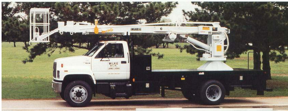
Combination Service Unit & Heavy Duty Crane