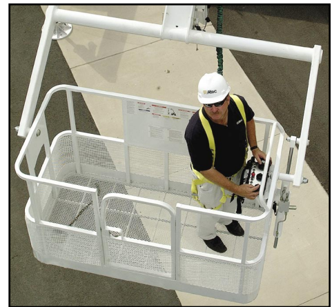
Optional 2-Man Platform