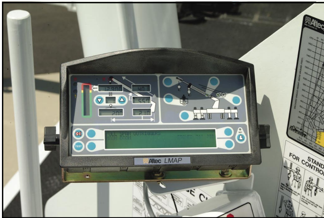
Altec LMAP System