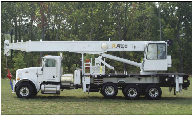
Vehicle Travel Height of 12.9 ft (3.9 m)

Ontario Service Center 831 Nipissing Road Milton, Ontario L9T 4Z4