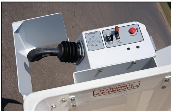
Optional Variable Speed Single Handle Controller