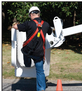
End-Mounted Splicer Platform