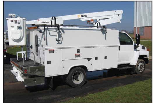
Optional Canopy Body