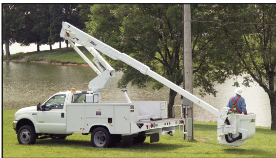
Easy Access From Ground

Altec Aerial Devices meet or exceed all applicable ANSI Standards as of the date of manufacture. Altec reserves the right to improve models and change specifications without notice or obligation.