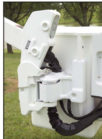
Boom Tip Covers