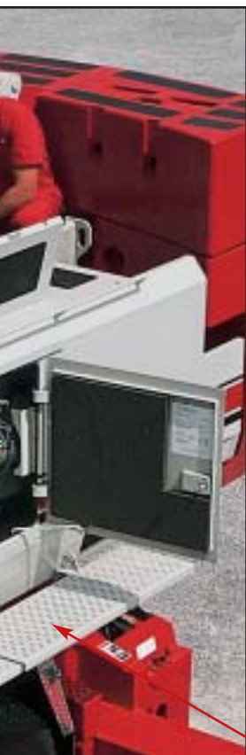
Left-hand catwalks optional

Independent hydraulic boom hoist is driven by a variable displacement axial piston motor through a gear reduction system. This system features infinitely variable boom hoist speed, automatic boom hoist brake and a limiting device that restricts hoisting boom beyond recommended minimum radius.