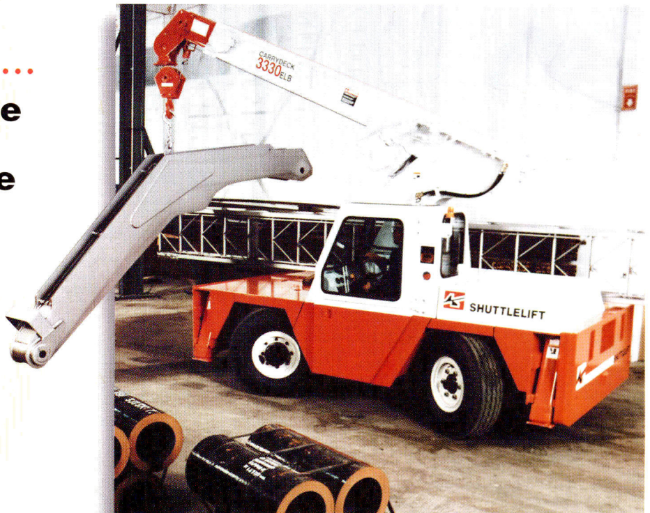
The 3330ELB Carrydeck Crane

Versatile, Productive Cranes for Complete Industrial Mobility