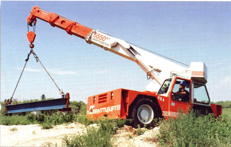
The 5550RT Carrydeck Crane