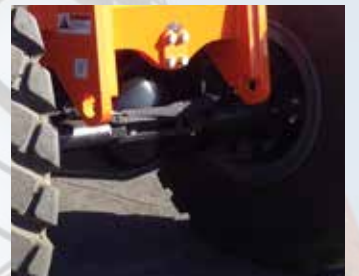
RUGGED KESSLER AXLES