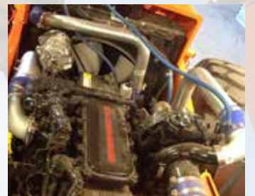
POWERFUL CUMMINS ENGINE