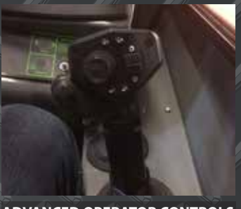
ADVANCED OPERATOR CONTROLS