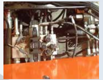
RELIABLE HYDRAULIC SYSTEM