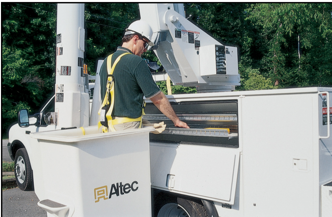
Altec L37M offers easy body compartment access from the platform.

Altec Aerial Devices meet or exceed all applicable ANSI Standards as of the date of manufacture. Altec reserves the right to improve models and change specifications without notice or obligation.