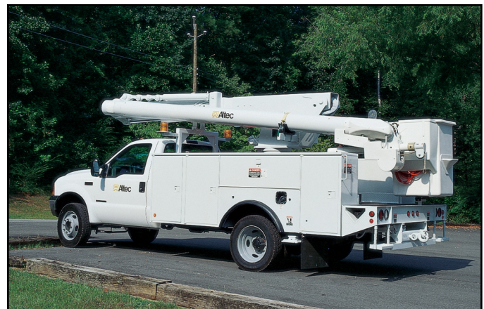
Low stow feature, low center of gravity and low travel height offers operator easy platform access, a stable driving unit and the ability to maneuver in low overhead areas.