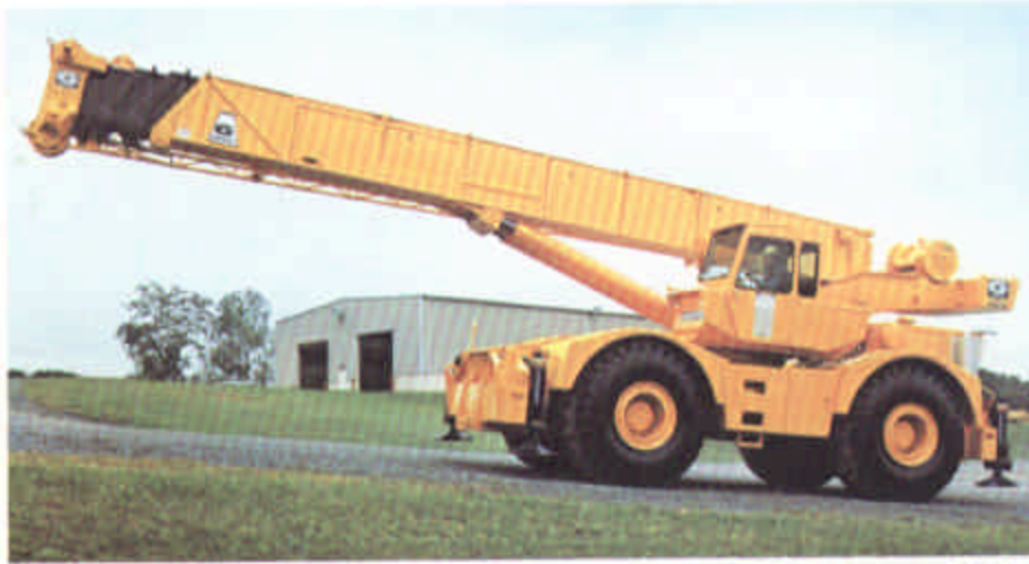
In addition to excellent mobility on all types of terrain, the RT75S features low overall height, low center of gravity, excellent ground clearance and a GVW of approximately 74,000 lbs. (33,566kg).