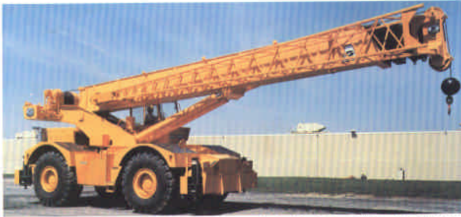
The "Swing Away" lattice boom extension stows laterally along side the boom base section and swings easily into working position to provide 121' (36.9m) tip height with the standard boom and 147' (44.8m) tip height with the optional boom.