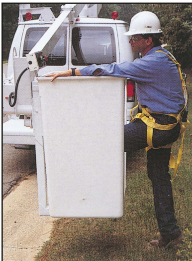
Easy Platform Access from the Ground

Altec Aerial Devices meet or exceed all applicable ANSI Standards as of the date of manufacture. Altec reserves the right to improve models and change specifications without notice or obligation.