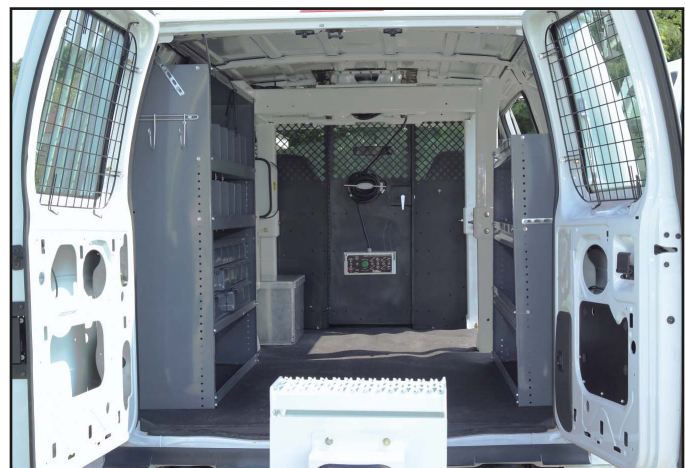
Optional Bridgemount Pedestal