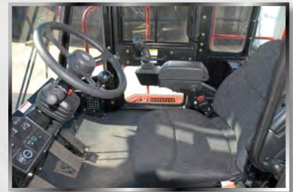
Spacious uncluttered cab with tilt steering, hinge-down dash, climate controls and adjustable seating Premium vinyl or cloth seat that rotates 15° left and 20° right