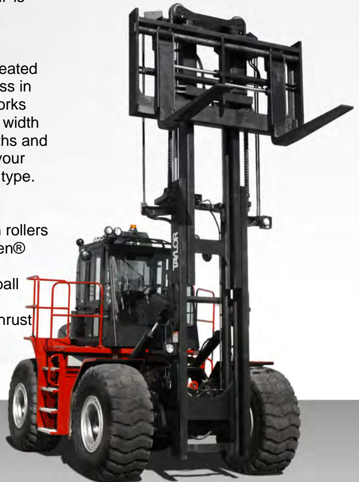
The TX4 maintains its rated capacity even at the full steer position.

Minimal maintenance with more resistant to dynamic/shock loads with rough terrain, high lift, and/or offset loads