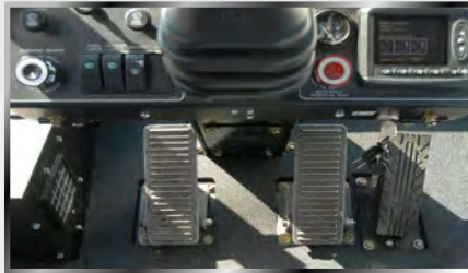
Two brake pedals left – brakes and inching right – brakes only