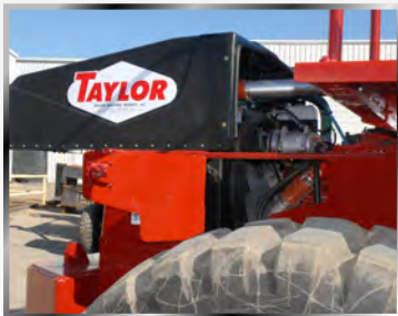
Sliding engine hood swing away doors on both sides for added access to the engine, filters and dipsticks