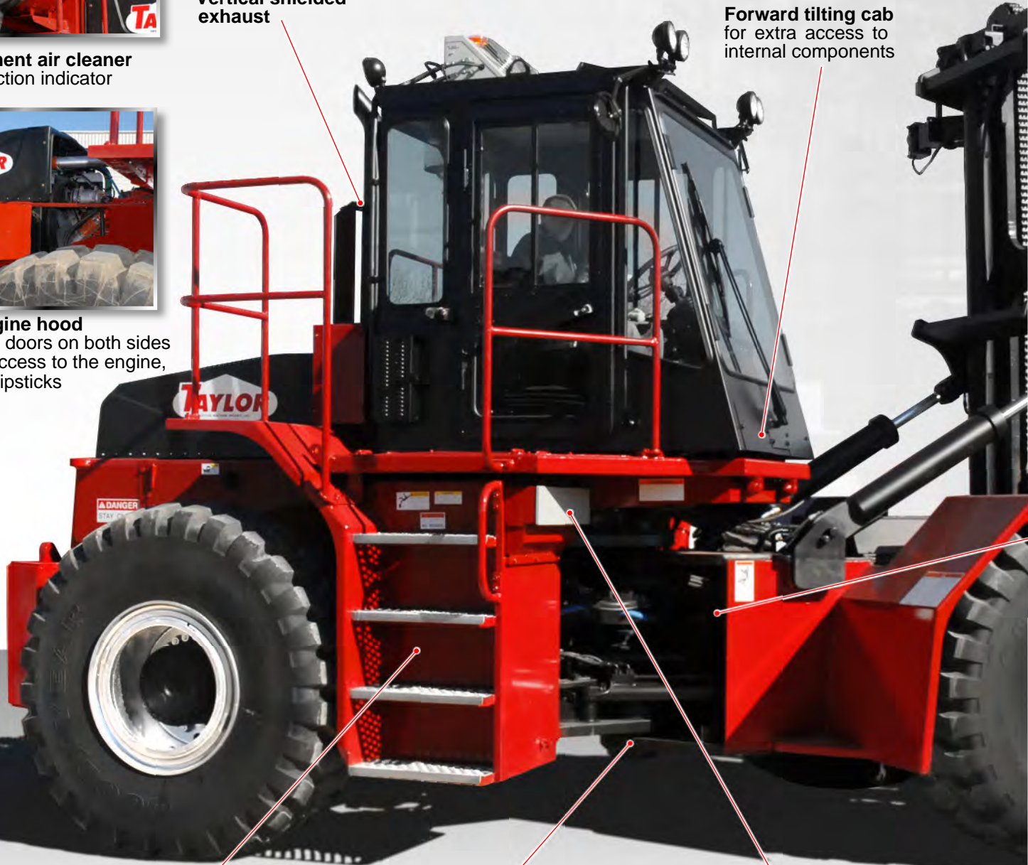
Hydraulic tank – • heavy gauge steel wall • serviceable filter element • tank mounted breather • internal suction screen • 55-gallon capacity Full flow, in-tank, 10-Micron return filtration