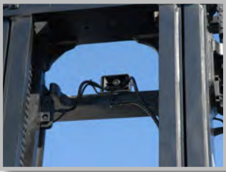
Forward activated alarm