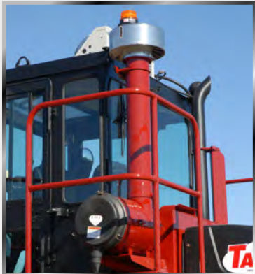
Dual element air cleaner with restriction indicator

Designed for optimum performance and dependability, Taylor Machine Works has made sure the very best materials and engineering went into this machine. The most reliable components available are brought together to make a truly unique lift truck.