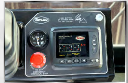
Easy to understand diagnostic display. TICS (Taylor Integrated Control System) using CANbus technology is standard on the TX Series.

The TX4 Series features a spacious, all steel cab with increased leg and head room, sound deadening rubber mat flooring, tilt steering wheel, simple T-shaped dash with hinge down instrument panel, fingertip electric joystick controls, and optional climate control system for operator comfort and convenience.