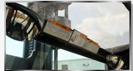
Dual panoramic interior rear view mirrors standard Dual external side view mirrors standard Optional pedestrian camera and monitor

This blend of ergonomics and technology will help your operator be more efficient with the job at hand... handling materials.