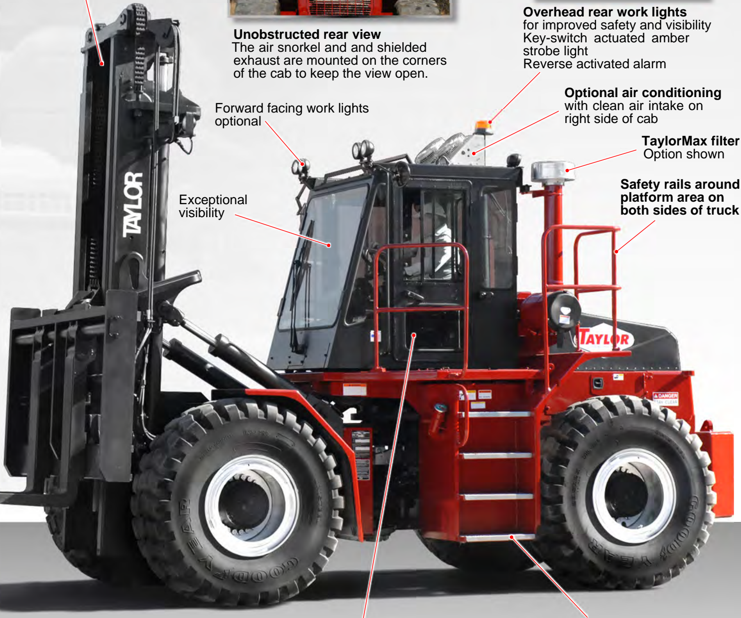
Forward facing work lights optional