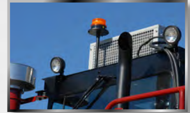
Overhead rear work lights for improved safety and visibility Key-switch actuated amber strobe light Reverse activated alarm