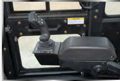
Comfortable adjustable arm rest with fingertip joystick control for smooth precise handling