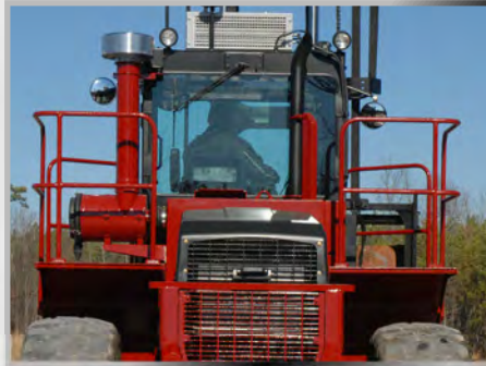
Unobstructed rear view The air snorkel and shielded exhaust are mounted on the corners of the cab to keep the view open.