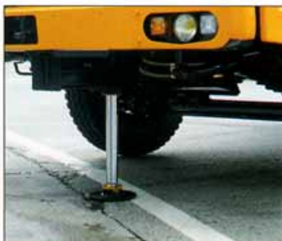
• Hydraulic front jack (Option)