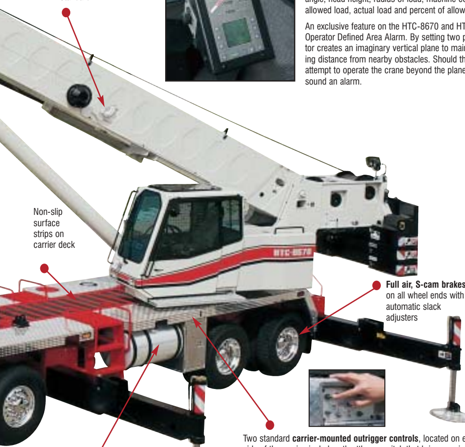
Non-slip surface strips on carrier deck