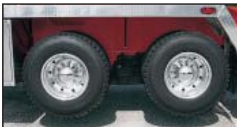
Another first from Link-Belt, the axle lift system holds the rear axles level while the crane is on outriggers.