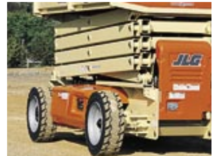
Optional All-Wheel Drive Provides Superior Performance On or Off Slab

*Certain options or country standards will increase weight.