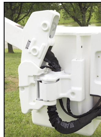
Boom Tip Covers

sales@altec.com Sales – 800-958-2555 Service – 877-GOALTEC