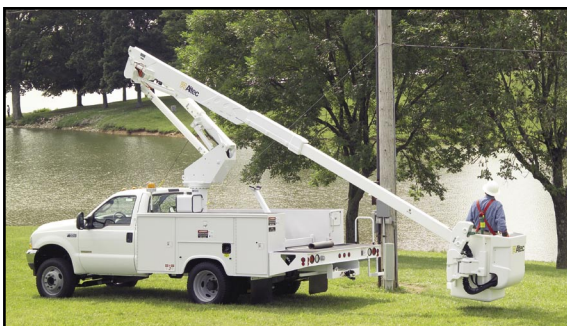
Easy Access From Ground

Altec Aerial Devices meet or exceed all applicable ANSI Standards as of the date of manufacture. Altec reserves the right to improve models and change specifications without notice or obligation.