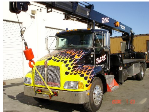
33,000 GVWR with Great Hauling Capacity

WORLD CLASS QUALITY FROM JAPAN. INDUSTRY DESIGN LEADER.