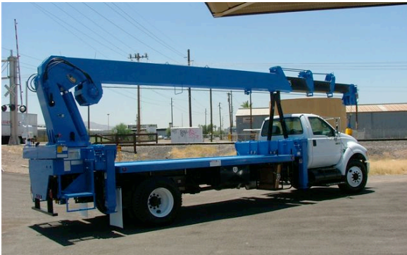
Rear Mount or Behind the Cab Mount