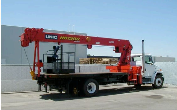
Capacity 30,000 lbs. - at 4ft