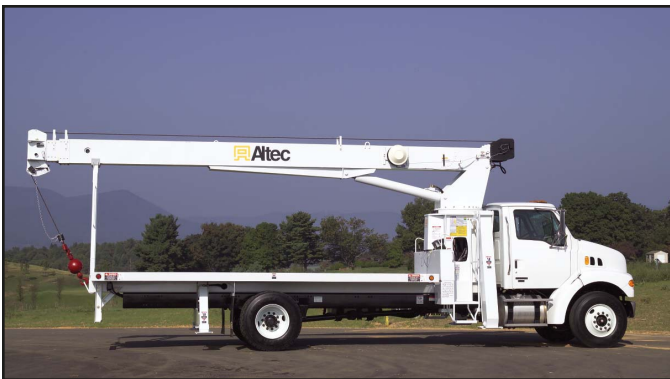
Vehicle Travel Height 12.8 ft (3.9 m)

Ontario Service Center 831 Nipissing Road Milton, Ontario L9T 4Z4