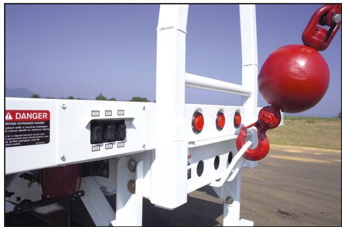
Easy Load Block Stowing