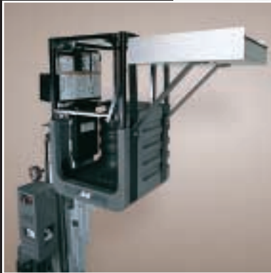
Molded Platform with Material Tray