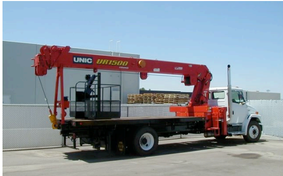
Capacity 30,000 lbs. - at 4ft