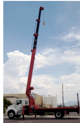
Boom Length 92 ft. - Retracted 28 ft.