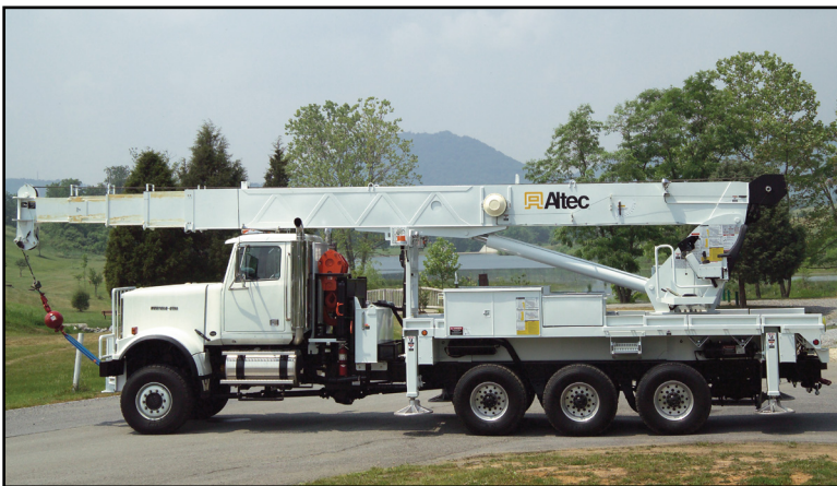
Vehicle Travel Height of 12.9 ft (3.9 m)

Ontario Service Center 831 Nipissing Road Milton, Ontario L9T 4Z4