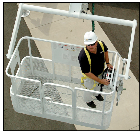
Optional 2-Man Platform

Altec Industries, Inc. 325 South Center Drive Daleville, VA 24083