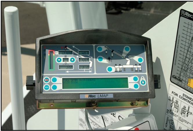
Altec LMAP System