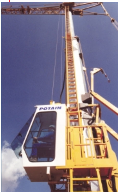
A lifting and removable cab |

A lifting, removable cab. In its quest for security, Potain imagined the HDT with a lifting cab on ladders, and small in size. A cab integrated onto the crane itself during transport.