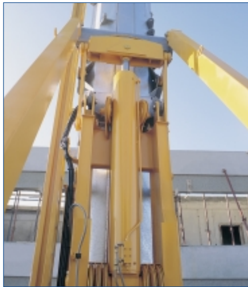
The hydraulic cylinder |