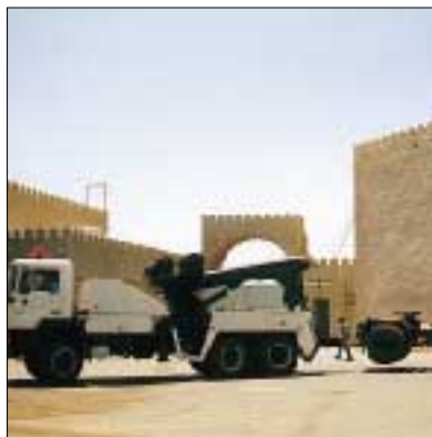
PK 55000 T