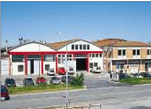
Cadelbosco di Sopra